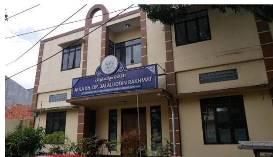
Figure 1. SMA Plus Muthahhari Bandung.

challenges. Despite the school's integration of national curriculum standards with foundation-based programs, lecture-based delivery and conventional assignments largely dominate classroom practices. Observations indicate that this approach does not fully resonate with students' learning preferences in the digital era, as many students prefer interactive and technology-enhanced learning experiences that engage them more effectively. The need for innovation becomes more urgent as schools seek to remain pedagogically relevant while maintaining their educational identity.