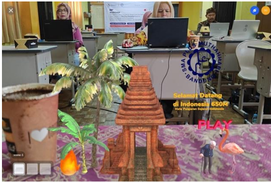
Figure 3. Workshop for Teachers.

strategies, emotional design principles, storytelling techniques, and the integration of Augmented Reality (AR) using the Assemblr application. The training combined presentations with hands-on collaborative practice, allowing participants to directly apply new concepts.