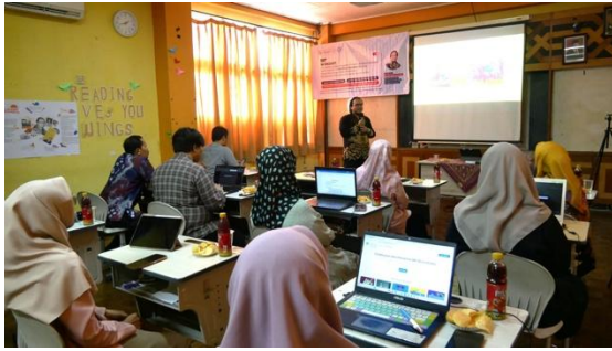
Figure 5. Teachers' Workshop.

The eight LKS covered a range of subjects, including Biology, Civics (PPKN), Indonesian History, Sociology, Indonesian Language, Economics, French Language, and Geography (Figure 6). The classroom trials were conducted across three grade levels—X, XI, and XII—with a total of 30 students participating as research respondents.