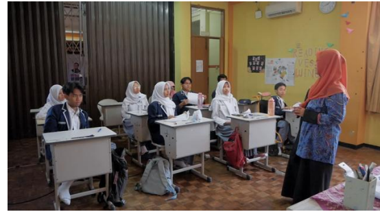
Figure 4. Trial Phase in the Classroom.

The trial phase was conducted on September 21–22, 2025, across three grade levels—X, XI, and XII—with a total of 30 students, including 14 males and 16 females. The participants consisted of 9 students from Grade X, 12 from Grade XI, and 9 from Grade XII.