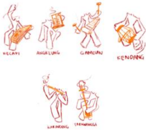
Figure 3. Sketch Process for developing musical instruments shape

with traditional design. By reframe identified problems and questions derived from pain points into possibilities that emphasize empathy (Razzouk & Shute, 2012). Additional influences such as environmental folklore, mythical creatures, and sacred water springs, further enrich the design direction.