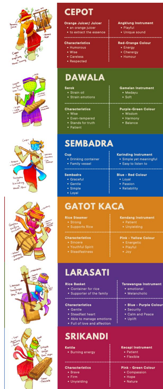
Figure 5. Color Symbolizing

perspective, stylization helps preserve cultural symbolism while adapting it to contemporary visual communication practices (Liu, 2022). As an example, the character of Gatot Kaca is depicted in pink and yellow to symbolize its energetic trait. Kendang - as its chosen instrument - is used to represent the character's persistence. Another one can be seen in the character Cepot, designed and covered in the spectrum of red to yellow to convey the character's sense of humor.