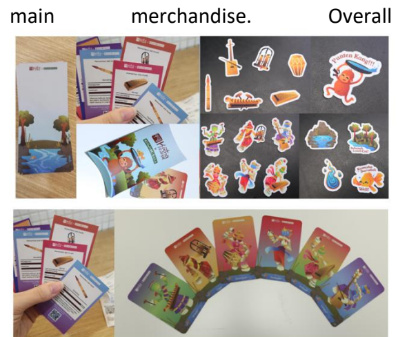
Figure 9. Supporting Printed Collateral

The third one – the packaging consists of a designed pillow-shaped box and a background to secure the keychain and the photo card. The name card is also included to hold information about the collaborative project, with its own social media accounts and e-commerce access. The packaging design aims to create an atmospheric representation of Desa Baros’s imaginative world-building. However, the overall design composition is controlled without overshadowing the