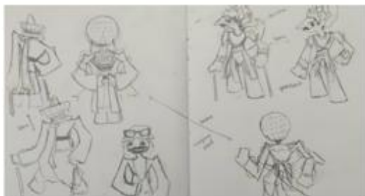
Figure 4. Sketch Process for developing Hand Drawn

The process begins with rough sketches (Figures 3 and 4), followed by refinement of color schemes and stylistic elements, resulting in six characters which are Cepot, Gatot Kaca, Srikandi, Dawala, Larasati, and Sembadra (Figure 5). Each character's color palette, ornamentation, and associated musical instrument correspond to and complement the characteristics of Wayang Serok. As seen in Figure 5, the instruments are drawn with accurate proportions, and the wayang design is stylized, adapted into more contemporary style. From a design theory