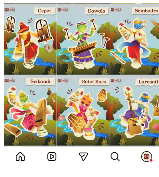
Figure 7. Characters Revealed in Social Media

The personalized keychain was made from a combination of printed acrylic, beads, and cords (see Figure 8 ). The materials are chosen for some variations in texture, color, and form to maintain visual unity despite distinct character identities. Color variation and size were specifically designed to correspond with each character, based on the color psychology (Jue & Ha, 2022).