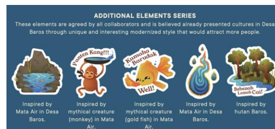
Figure 6. Supporting Characters

expression and a personal performative culture. This also refers to cultural memory theory - which holds that art and merchandise, as everyday objects, are turned into a media that embody both cultural narrative and personal memories. (Wang & Ge, 2025).