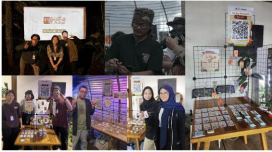
Figure 10. Documentation from exhibitions

The exhibition functioning as primarily a public presentation and encouragement moment. The audiences responses and feedbacks were captured and documented by direct observation and spontaneous feedback after the process behind were explained.