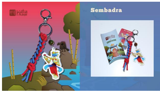
Figure 8. Character – Sembradra in a personalized keychain as merchandise

In addition to the keychain, a printed paper collateral – photocards, stickers, name cards, and packaging – was also part of the design’s visual identity. The final visual assets were printed on a 260 gsm doff-textured paper, maintaining the durability and quality of the product. The photocards were printed double-sided on 310 gsm paper – following the photocard standard – featuring the character’s illustration on the front side and information on their strength and personality on the other (see Figure 9 ).