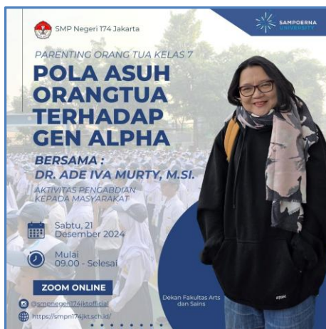
Figure 2. Online Seminar e-flyer

The event duration confirmed was 120 minutes in online seminar mode, including the seminar and Q&A session. The school designed an event e-flyer for publication before the event and posted it on social media. Figure 2 shows the published e-flyer design.